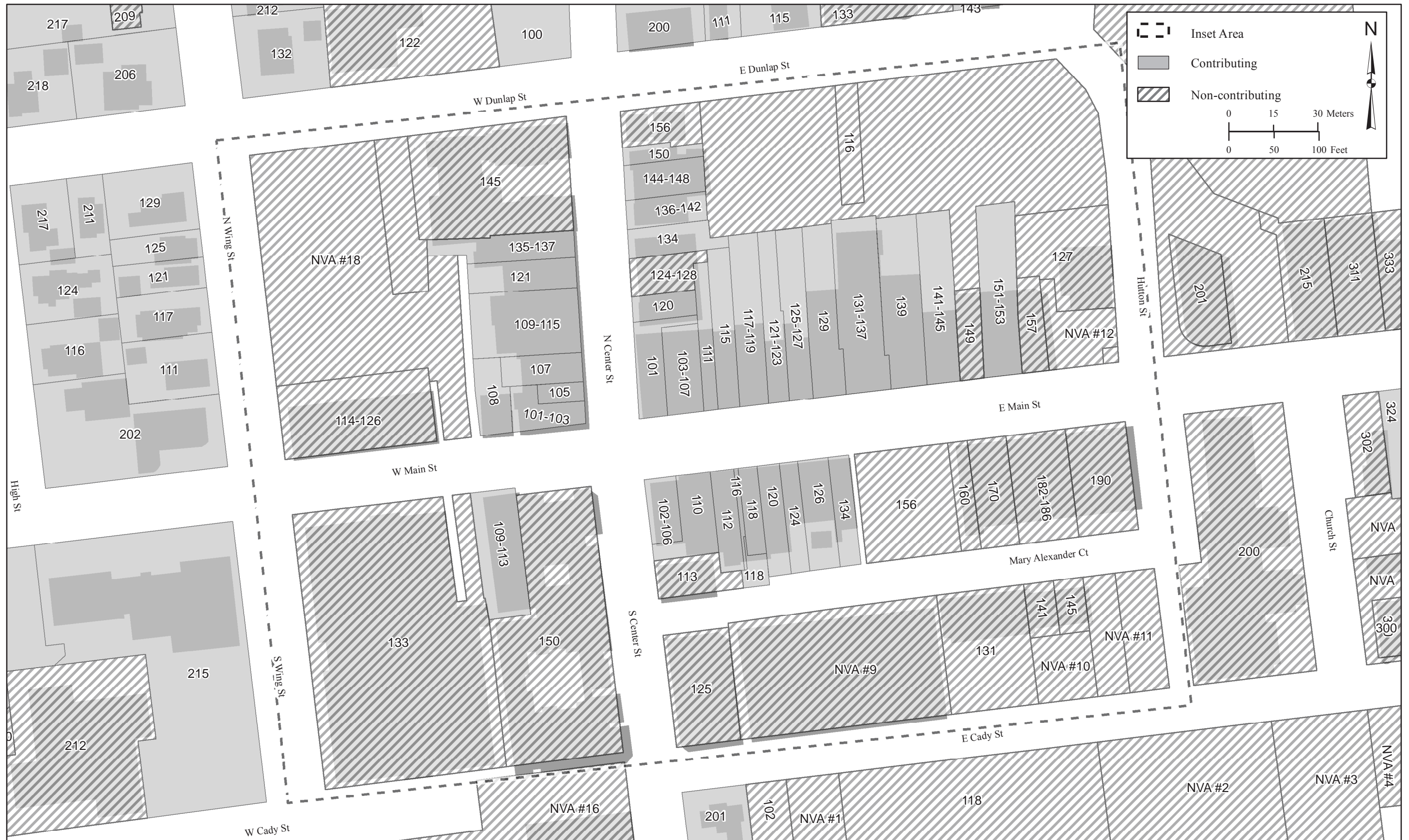
Figure 2-2. National Register Boundary: Northville Historic District, Northville, Wayne County, Michigan