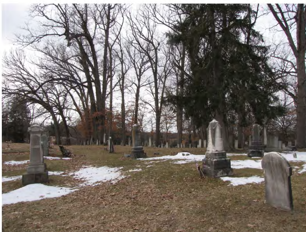
Cady West NVA 17_Looking Southwest